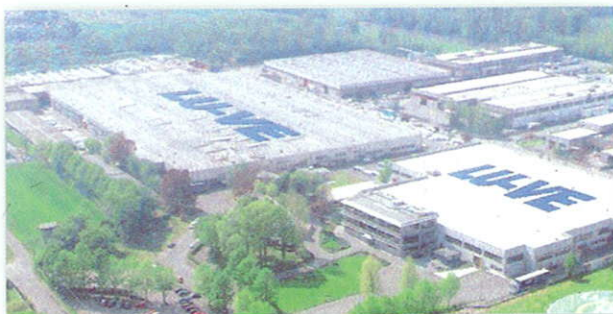
Lu-Ve Group Headquarter

The Lu-Ve Group has the combination of experience, tradition forward thinking and innovation. This Group is the embodiment of the principle that, first and foremost, companies are women, men and ideas. People with years of experience, young people gifted with creativity and enthusiasm, well qualified professionals, all united in their passion for their work and in their vision of a world, which will be more aware, more livable, more advanced and better balanced.